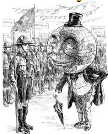
1920 Punch Cartoon showing the World meeting South Africa.